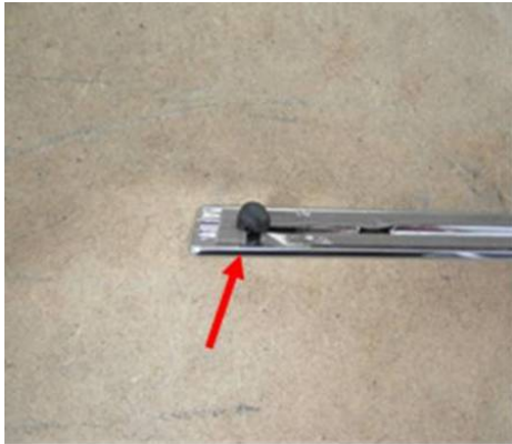
Figure 6 (rear trim strip area)