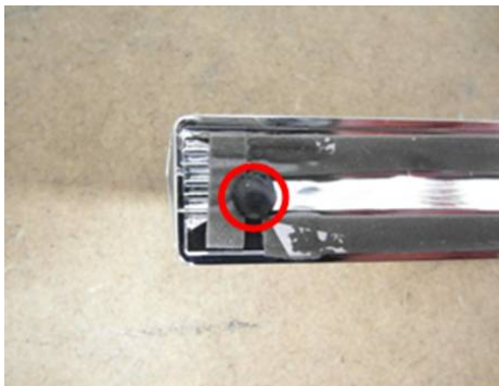
Figure 5 (rear trim strip area)