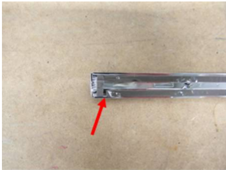
Figure 3 (rear end of a trim strip)