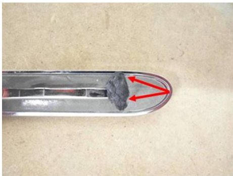
Figure 7 (front trim strip area)