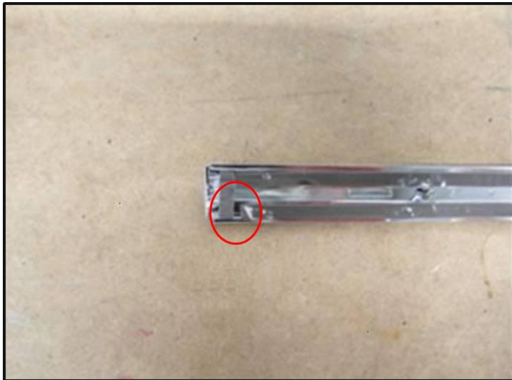
Figure 2 (the red circle shows the opening of the incomplete bonding)

Because of incomplete bonding of the trim strip (Figure 2, red circle) water can get between trim strip and door. Because of water ingress, corrosion is possible in the area of the guide holes (Figure 1, red circles).