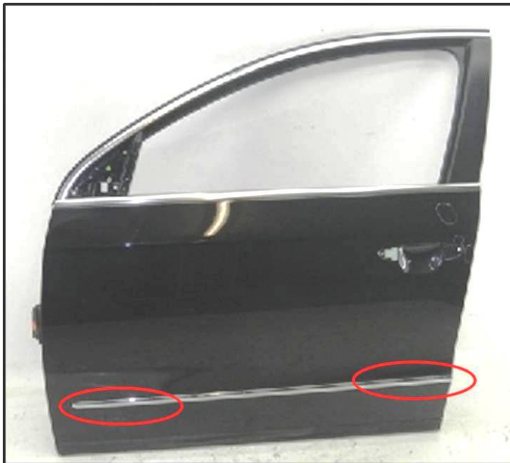
Figure 1 (the red ellipses show the area which can be affected by the corrosion)