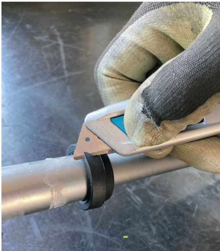
Figure 2: Rubber ring at the intermediate steering shaft.