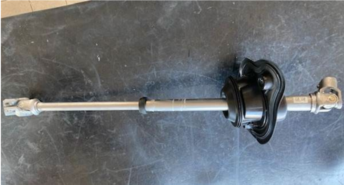
Figure 1: Intermediate steering shaft.

Then use a knife to cut off the rubber ring on the intermediate steering shaft on the sleeve side at a 45° angle (Figure 2).