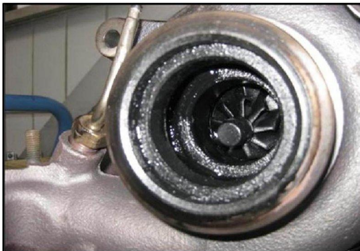
Figure 1 (broken turbocharger shaft, engine oil ingress on exhaust side)