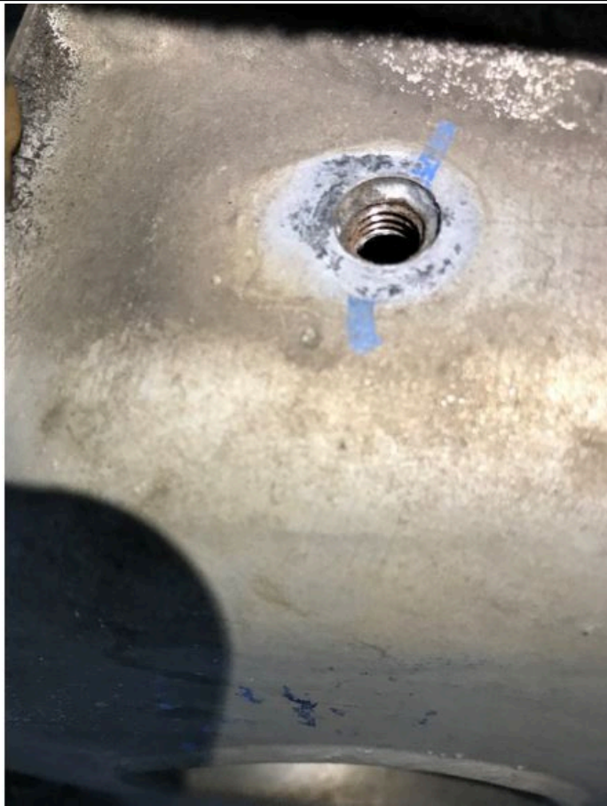
Grounding locations M178_BR190_engl.pdf