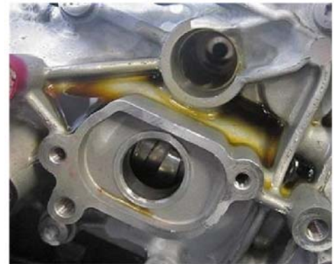
Fault type 2: Cylinder head cover leaking

2.10 Install fuel collection pipe, see ⇒ Workshop Manual '243019 Removing and installing fuel collection pipe (V6 Turbo)' .