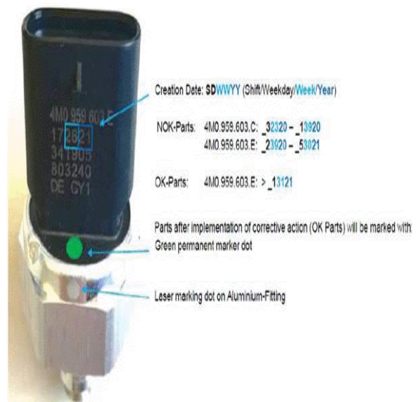
Figure 1. Pressure and temperature sensor markings and build date.