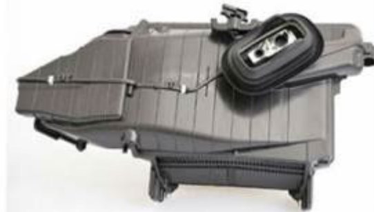
Figure 1. HVAC evaporator and housing.

The refrigerant circuit head pressures are checked, found to be insufficient and after recovering the refrigerant volume the diagnostic finding is determined that the refrigerant volume in the circuit is very low or empty. DTC B10AE21 (High-pressure sensor Lower limit not reached) may be stored in the Heating/Air Conditioning Electronics control module, E87 (address word 0008). Leak identification dye is added to the refrigerant circuit along with a full charge of the refrigerant and the vehicle is test driven. Correct cabin cooling is restored. A visual inspection of the refrigerant circuit is conducted and no obvious leak can be seen under UV lighting. When using an electronic refrigerant leak detector at the central vents and condensate drain it alerts that the evaporator core may be the source of the leak.