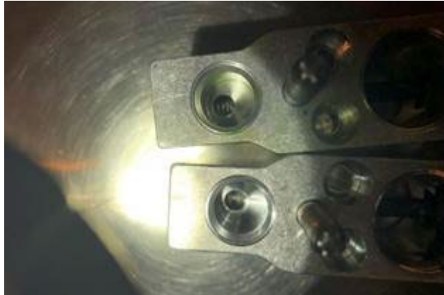
Figure 4. Leak at expansion valve connection evidenced by residue from the contrast agent.

If a refrigerant leak is detected from the evaporator core/expansion and valve/refrigerant line junction, take a short video showing the diagnostic confirmation of a leak in this area and post it to Doc-IT. Then, replace the expansion valve and all four O-rings without replacing the evaporator (figure 4). Re-test to ensure that the refrigerant leak is solved without the replacement of the evaporator core. Photograph any damage to the expansion valve ports, damaged o-rings, or refrigerant line connections and post these to Doc-IT as well.