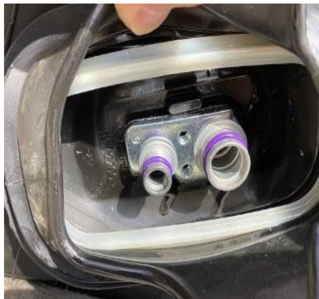
Figure 3. Refrigerant connections to the expansion valve.