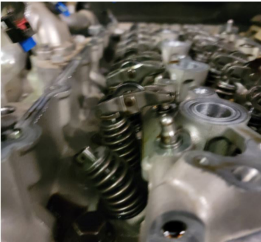
(Picture below shows a typical method used to check for worn roller followers)