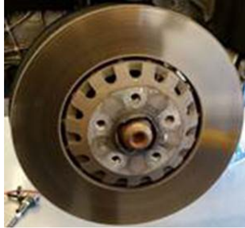
Figure 7. Example of the whole disc.