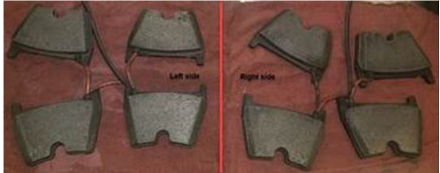
Figure 11. Example of pads without adhesive (mark position for reinstallation if not replaced).