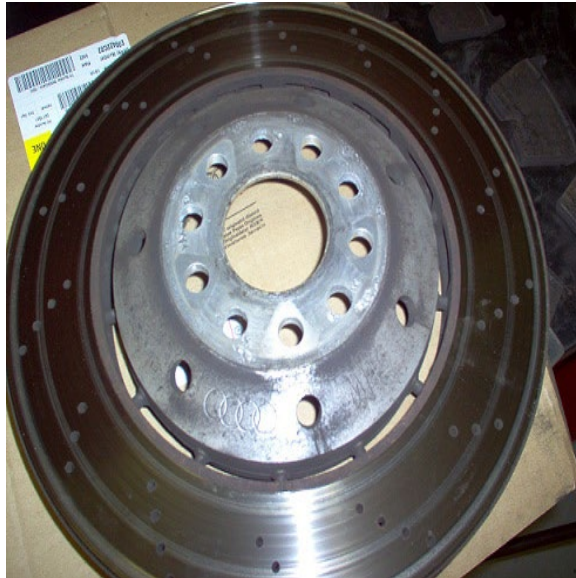
Figure 2. Grooved disc.