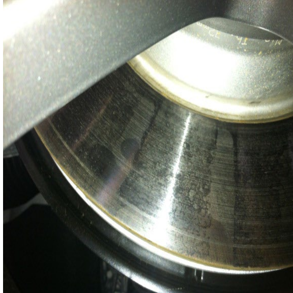
Figure 3. Discoloration on the brake disc due to chemical contamination from the cleaner that was sprayed directly onto the disc.