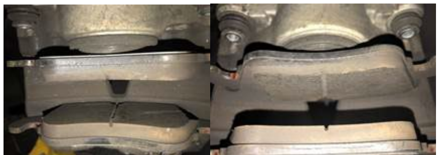
Figure 9 and 10. Example of Inner and outer with an adhesive pad.