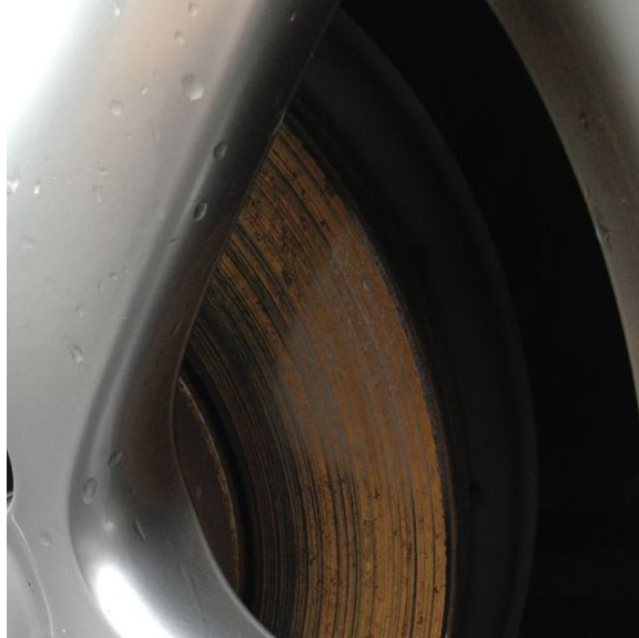
Figure 1. Disc covered with rust.