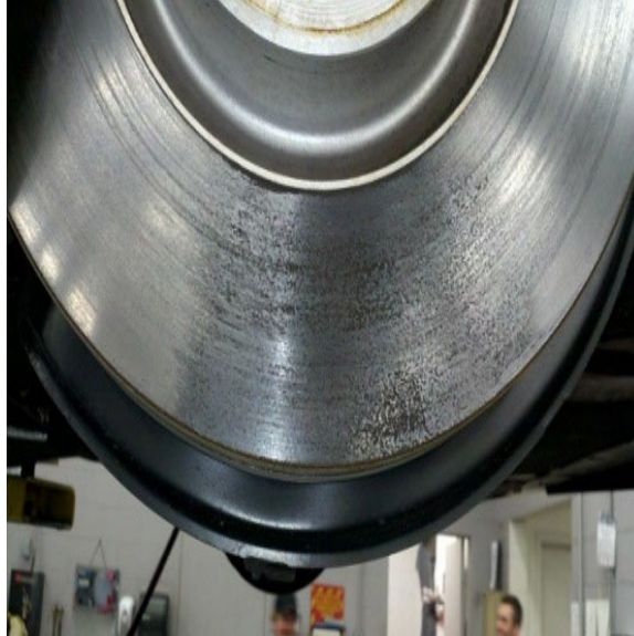
Figure 5. Brake pad material has transferred to the discs.