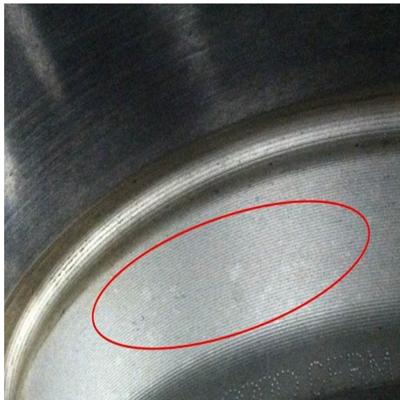
Figure 4. Small spots and discoloration due to chemical contamination from the cleaner that was sprayed directly onto the disc.