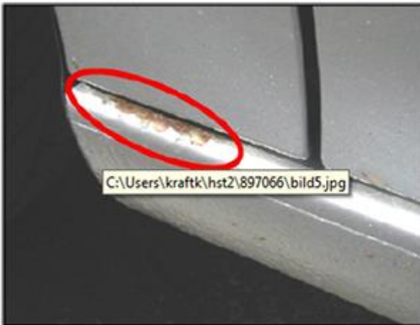
Figure 1 - corrosion in the area of the rocker panel/front fender