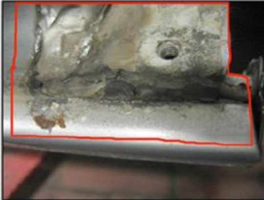
Figure 3 - fender removed (corrosion on the contact surface of the rocker panel [side member])