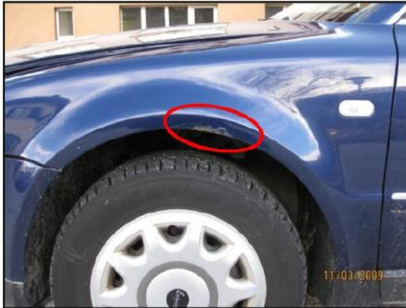
Figure 1 (corrosion on left wheel arch)