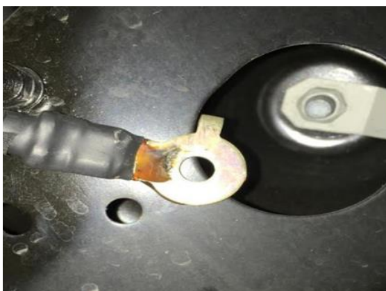
Heat Shrink Glue Interference.

Discussion: As part of diagnostics for U0131-00, connections of the EPS grounds to the frame should be verified. It may be necessary to disassemble, clean both sides of the eyelet and the ground stud location with Emory paper. Also inspect the eyelet for heat shrink glue. Carefully Trim any glue from the contact surfaces with a razor knife. Inspect the ground stud for weld spatter that could prevent a consistent flat electrical connection. Carefully grind or file down the spatter to provide a flat connection point. Refer to the images below.