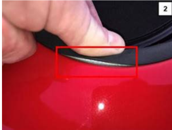
Figure 2. Checking the adhesion quality.