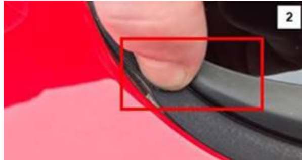
Figure 5. Clear evidence of adhesive detachment.