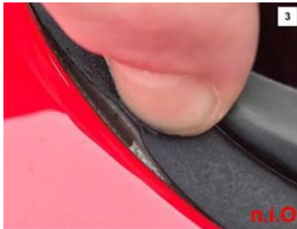
Figure 6. Seal adhesive band detachment revealed.