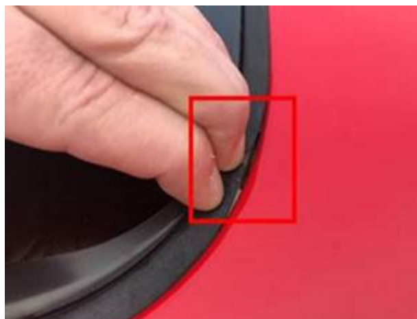
Figure 7. Adhesive band detachment.