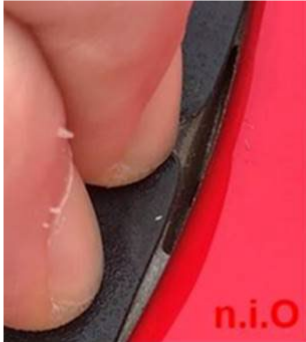
Figure 8. Close-up view of the detachment area from Figure 7.