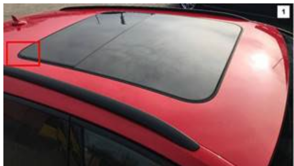
Figure 4. Begin inspection of the rear portion of the perimeter seal.