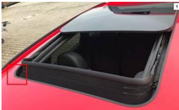
Figure 1. Front sunroof panel open.