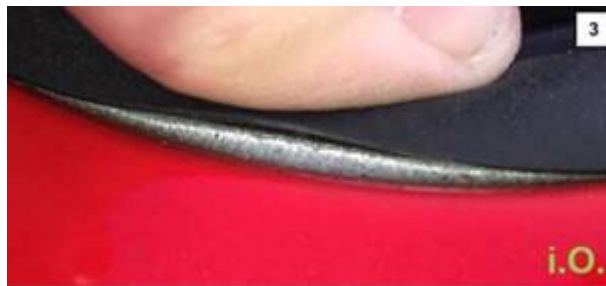
Figure 3. A properly adhered perimeter seal.