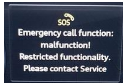
Figure 1. Emergency call malfunction warning.