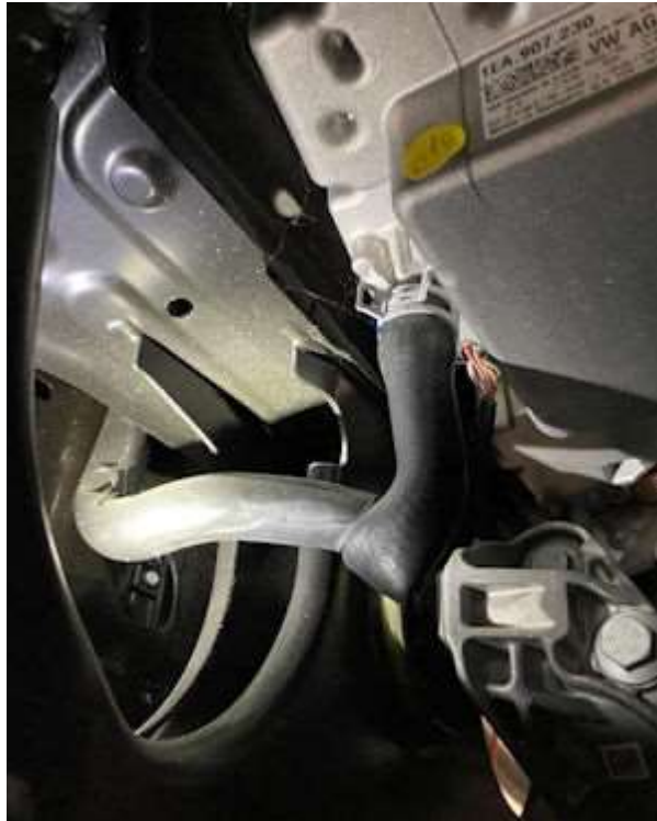
Figure 1. Hose twisted at rear power electronics.

Following are several examples of different conditions and locations to inspect.