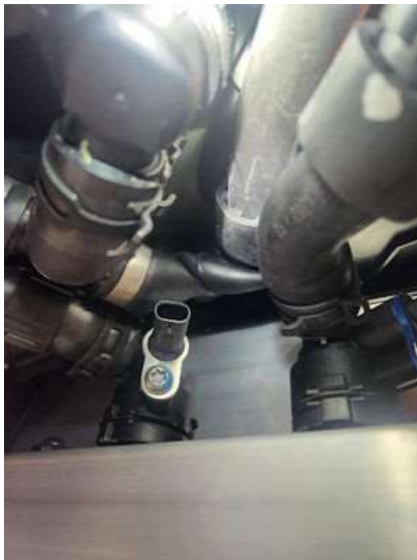
Figure 3. Hose twisted at front of high-voltage battery.