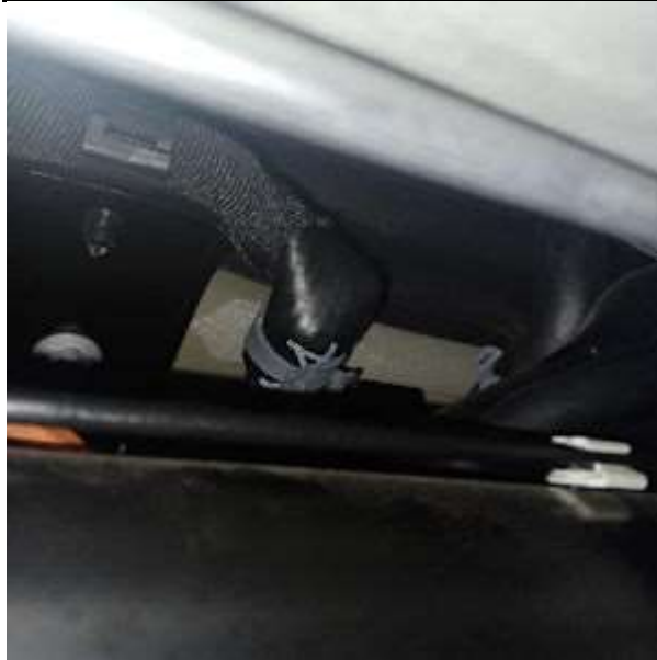
Figure 2. Hose twisted at rear power electronics.