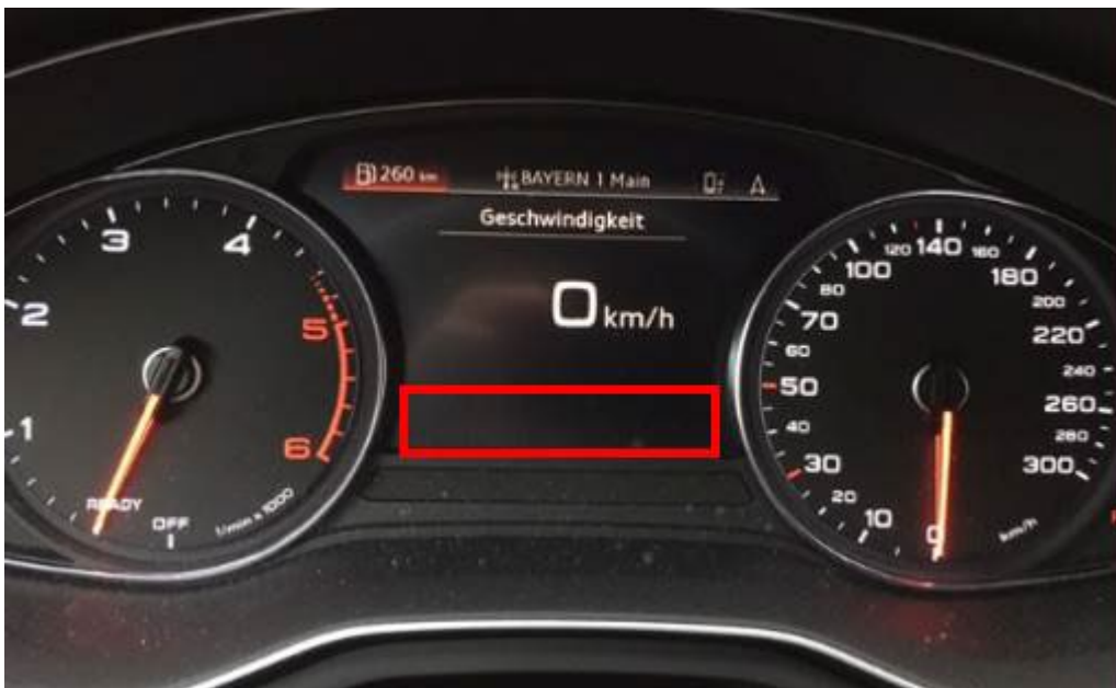
Figure 1: Status display blank.

Workshop Findings: The status display returns after a sleep cycle, no DTC is associated with the blank display (Figure 1).