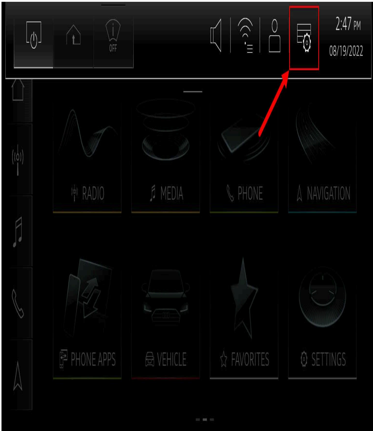
Figure 1: Notification shortcut button in the dropdown menu.