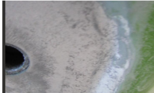
Pitting Found After Sanding Example (Fig. 1)

Note: If pitting is found during the sanding process, please use LOP 23-75-XX-XX for up to 0.5 hours in conjunction with the 23-85 replacement LOP.