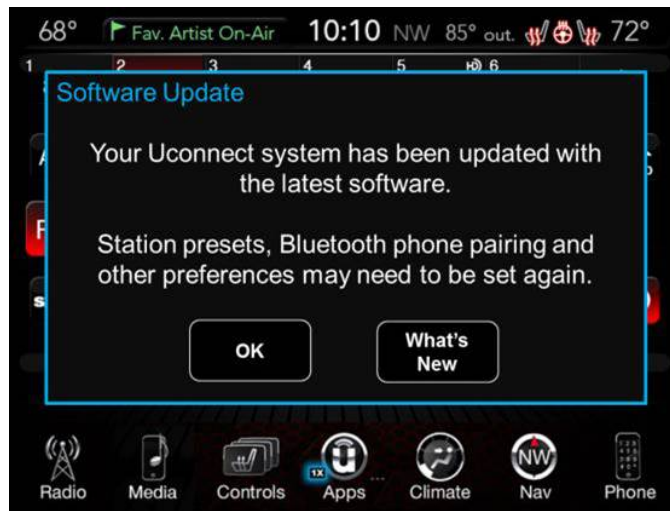
Fig. 4 Software Confirmation