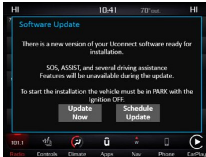
Fig. 1 Software Update

Customers will see a notification on their radio screen when new software is available for their radio Fig. 1 . The owner will have the option to update the radio or schedule the update for later. There is not an option to decline the update indefinitely, the update must be performed.