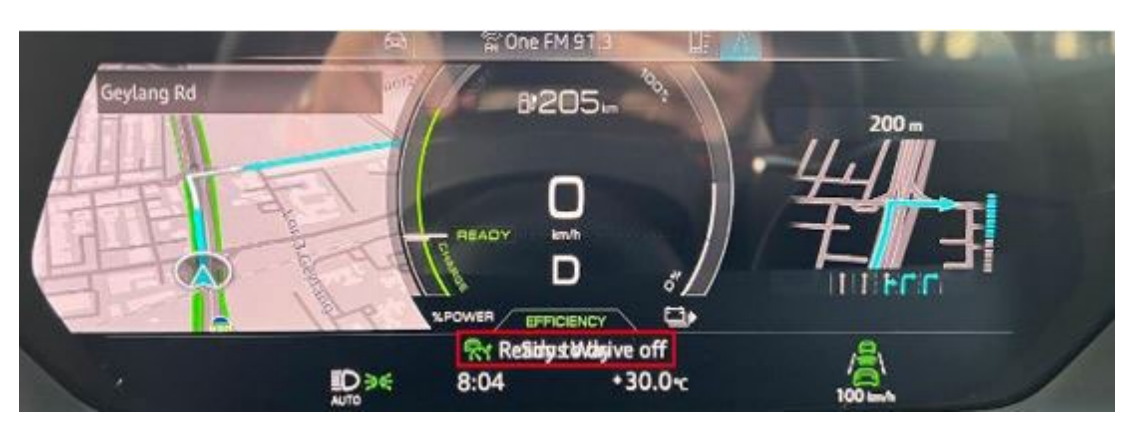
Figure 1: Superimposed content inside red square.