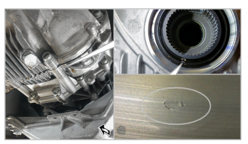
Oil leakage on the transfer box