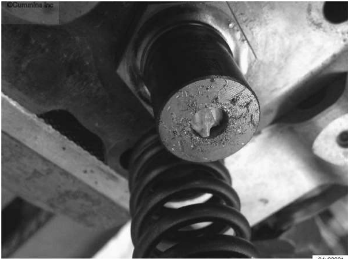
Figure 1, Fractured Fuel Pump Ceramic Pumping Plunger on CM2250 Engines.