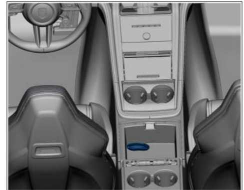
Place remote control in emergency start tray

Switch on ignition: Press the Start-Engine-Stop ⇒ Start-Engine-Stop button -1- button without stepping on the brake pedal.