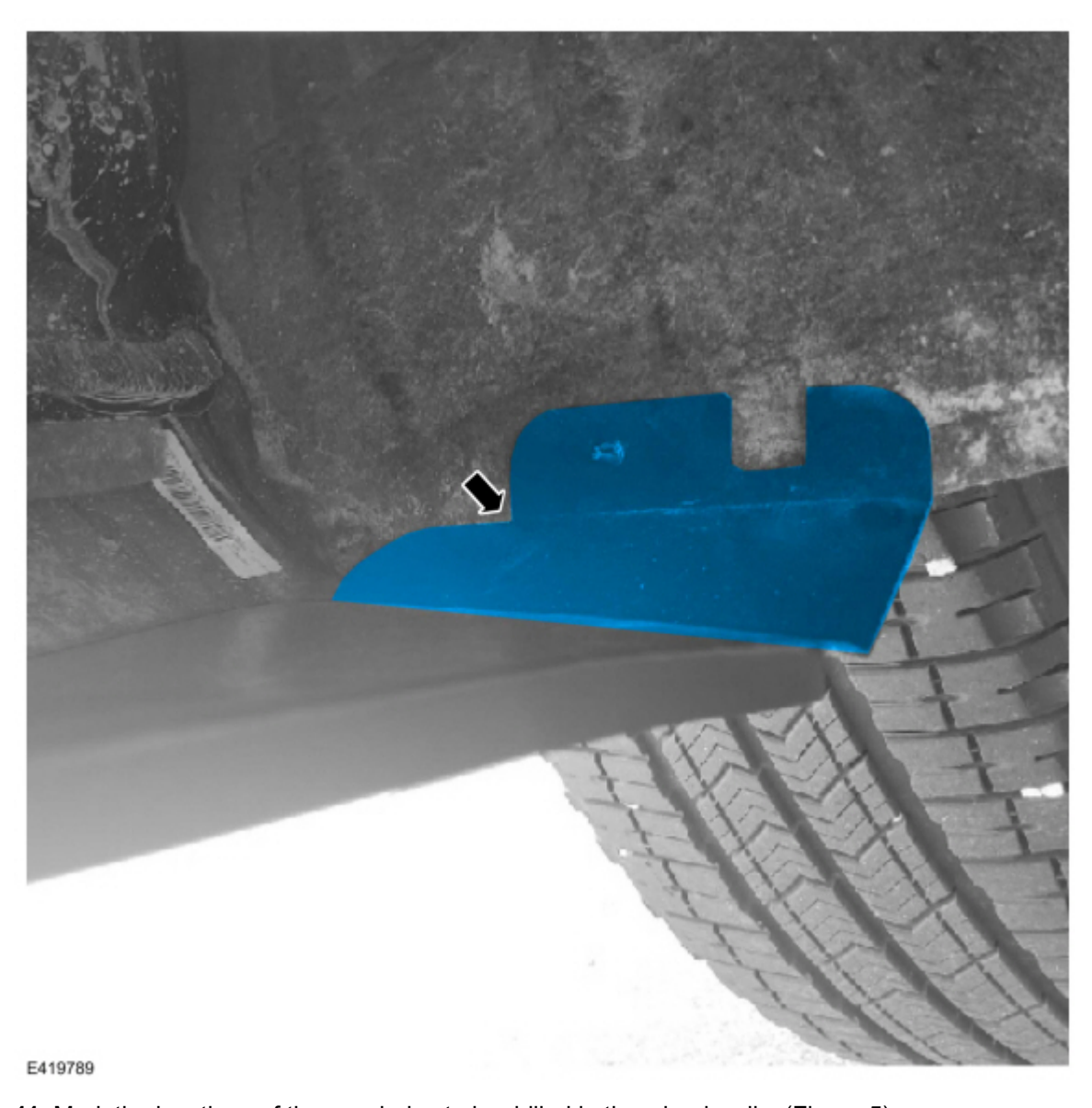
11. Mark the locations of the new holes to be drilled in the wheel wells. (Figure 5) Figure 5