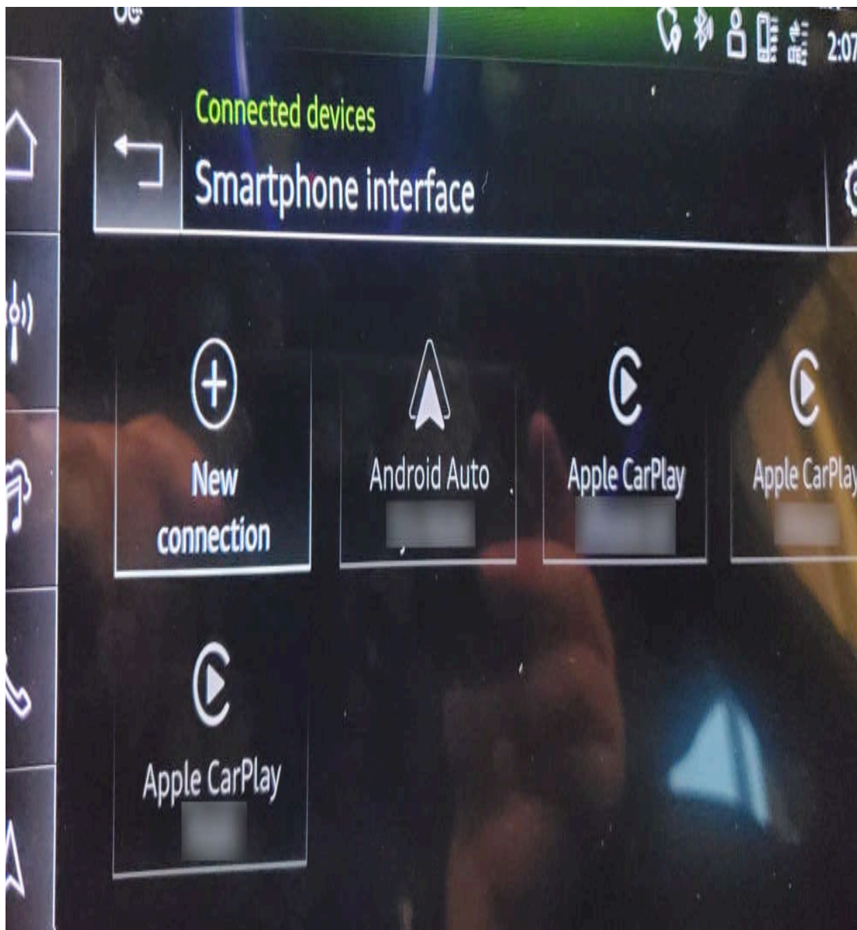
Figure 1: wASI connections grayed out.