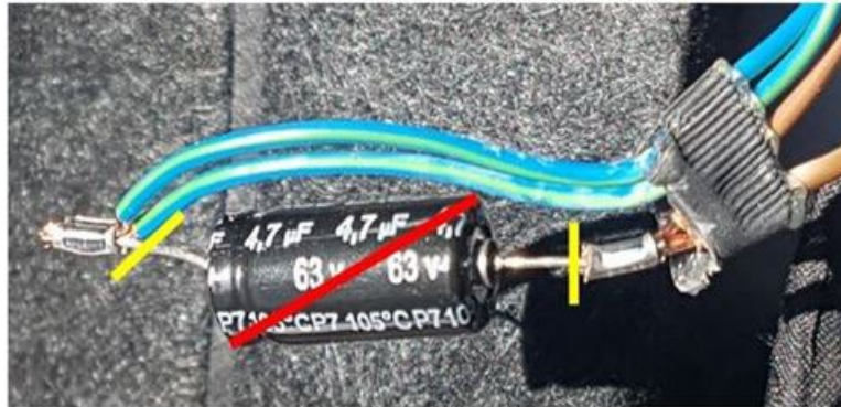
Figure 2: Suppression capacitor C24.