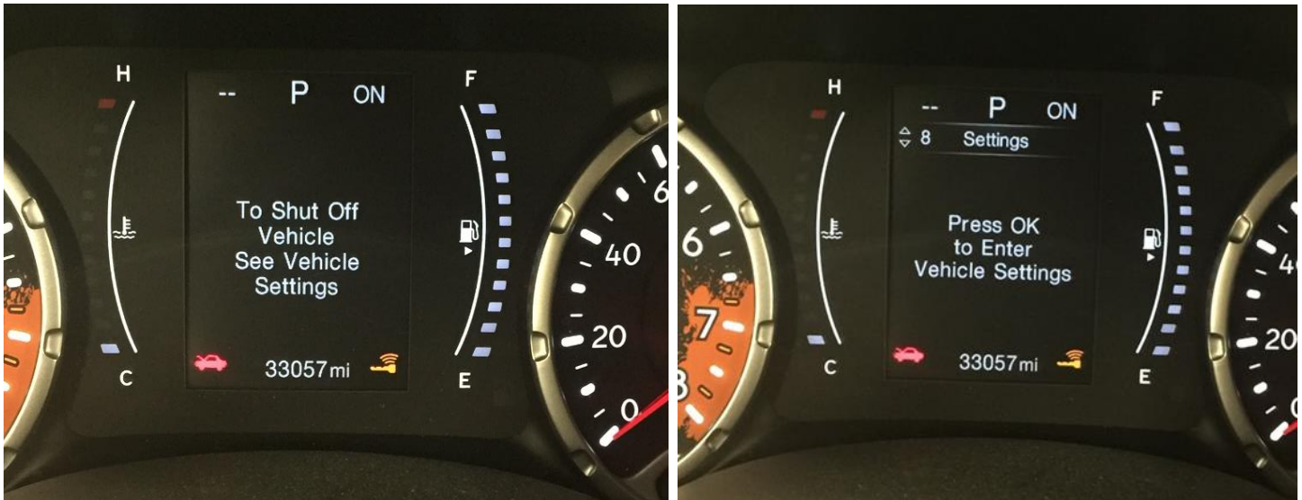
Step 1: Using the EVIC Controls, enter to the “Settings” Menu

Note: Ensure the vehicle is parked in a safe location which is accessible by a tow vehicle. The vehicle WILL NOT RESTART after performing this procedure unless the fault is cleared or the battery is disconnected