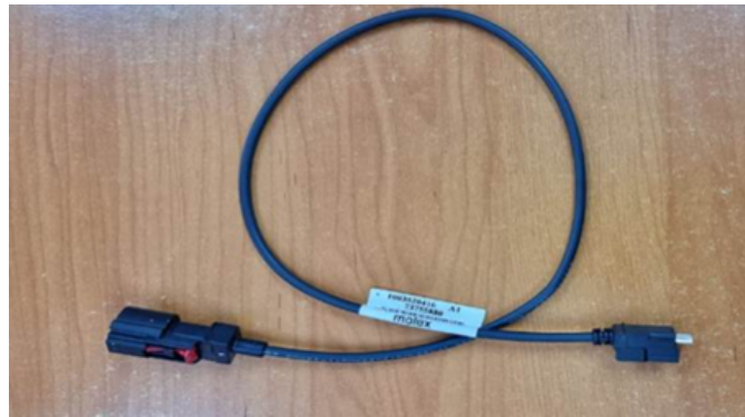
Fig. 1 USB Cable For Center Console Harness