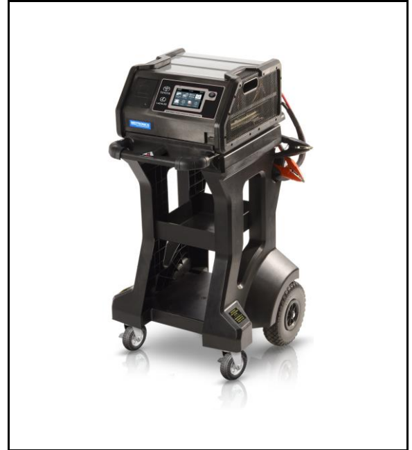
Figure 1. DCA-8000 Battery Diagnostic Tool