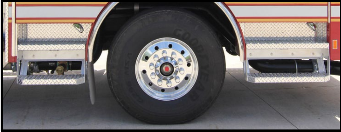
Option 2 Dual fixed steps

Option 3 Replace Power Cab Step System with Air Step System Option 0799676 Steps, 4-Door Cab, Automatic, Air, Imp/Vel