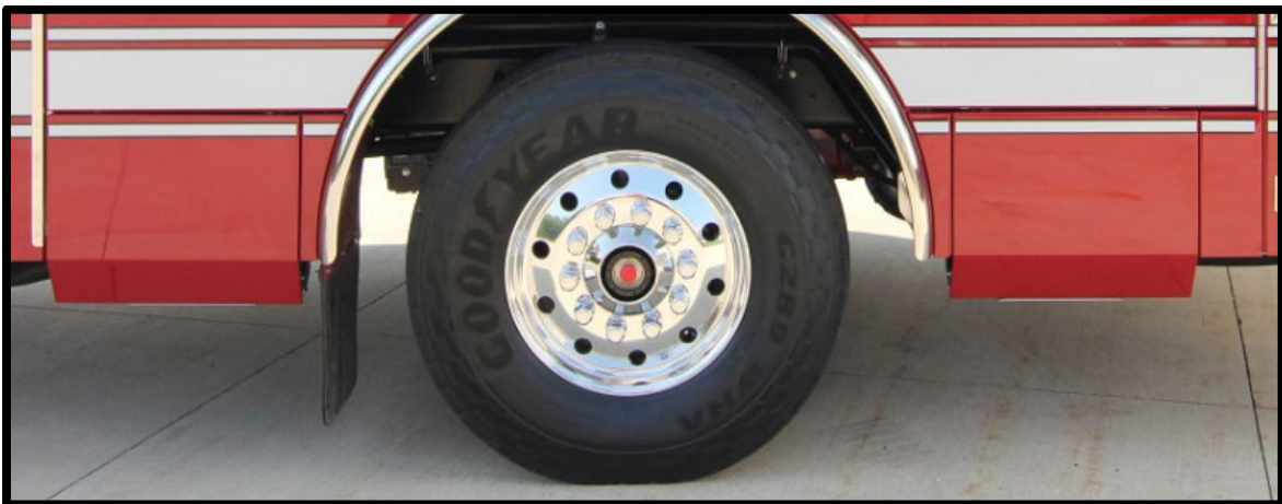
Option 3 Air Steps Retracted

If any additional support is needed, please open a technical support incident on Pierceparts.com .