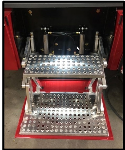
Option 3 Air Steps Extended