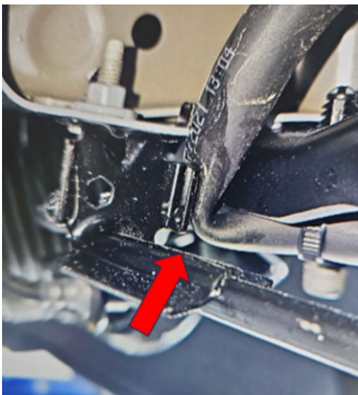
Example of a pinched hose on a 2023 Cadillac Escalade below: