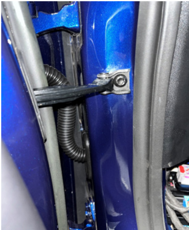
Figure 10 Door Harness Connection Point (1)