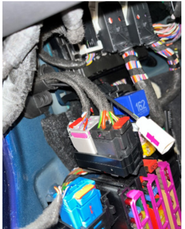
Figure 11 Door Harness Connection Point (2)