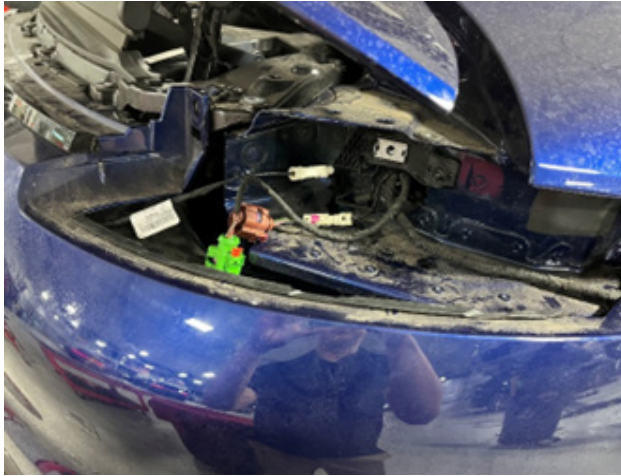
Figure 8 Rear Camera Connection Point (Right Rear Taillight)