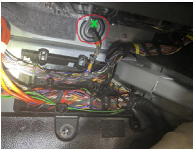
Figure 6 Cabin Side - Passenger Footwell Grommet