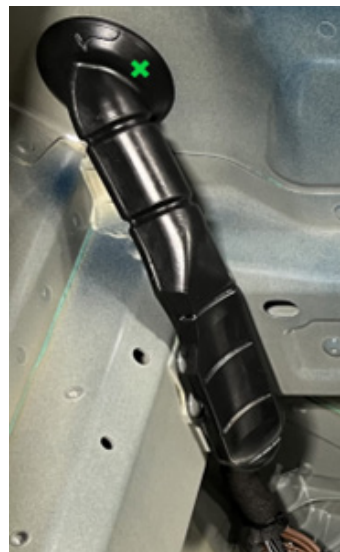
Figure 7 Tub Side - Passenger Side Grommet