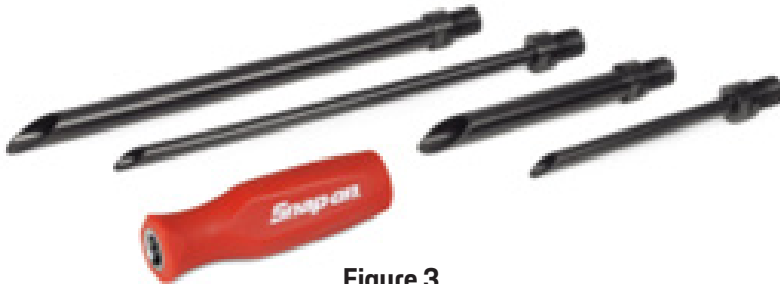
Figure 3 Snap-On - WINS1000R

Recommended using VAS 6720 & Wire Insertion Tool Set (e.g. Snap-On - WINS1000R).