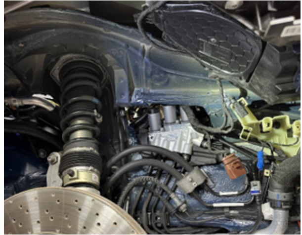
Figure 9 Front Camera Connection Point (Front Right Wheel Well)