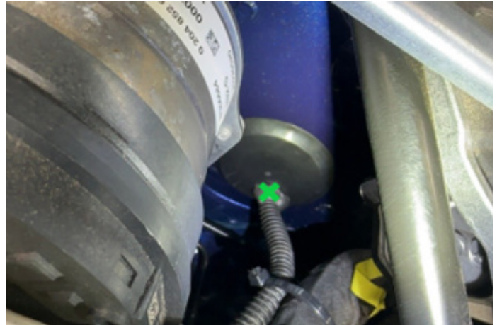
Figure 5 Exterior Side - Clutch Master Cylinder Grommet