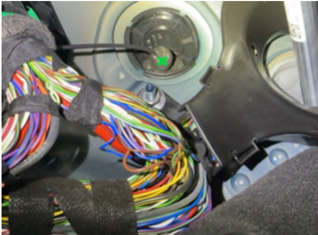
Figure 4 Cabin Side - Clutch Master Cylinder Grommet