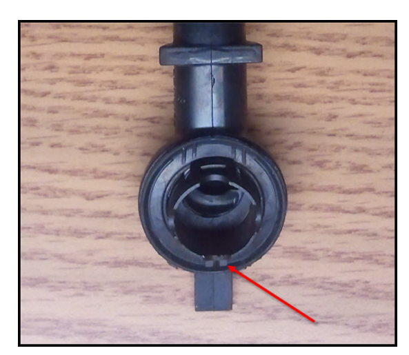
Figure 4. Snap ring installed in the correct position.

Connect the hose to the body before connecting it to the HVAC unit. Insert the locating tab (bottom of the hose) into the body hole and press the top portion of the snap ring into place.