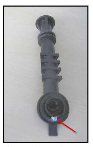
Figure 3. White mark on locating tab.

Service parts have been checked, but it is still possible to receive unchecked parts. Corrected parts will be marked in white on the locating tab. This tab must be pointing down (Figure 3).