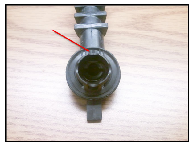
Figure 1. Incorrectly assembled drain hose, with locating tab pointing up.

When the snap ring is installed upside down, it allows water to leak out through a hole at the bottom of the snap ring (Figure 2). The water can then soak into either of the front footwell carpeted areas.