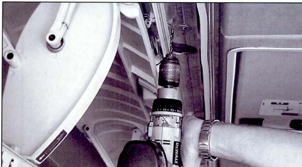
Figure 2. Reference photo.