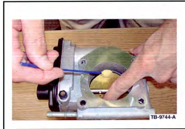
Figure 2 - Article 12-7-4