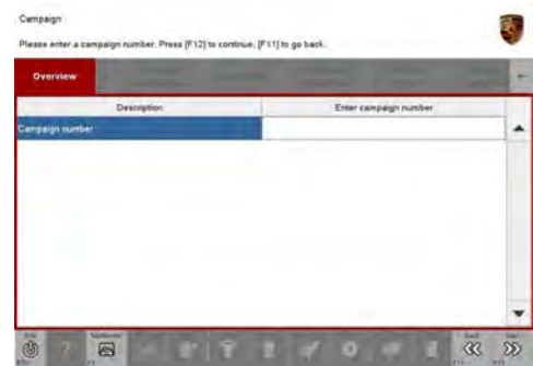
Programming number input field