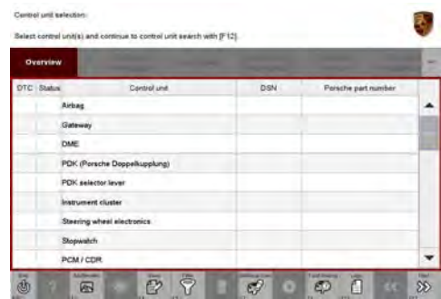
Control unit selection