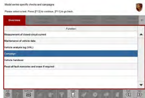
Additional menu – Campaign

You are then prompted to enter a programming number.