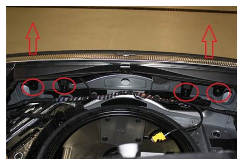
Figure 2. Rear cargo area trim plate removal in the Audi Q7. The T25 Torx® screws to be removed are circled in red.