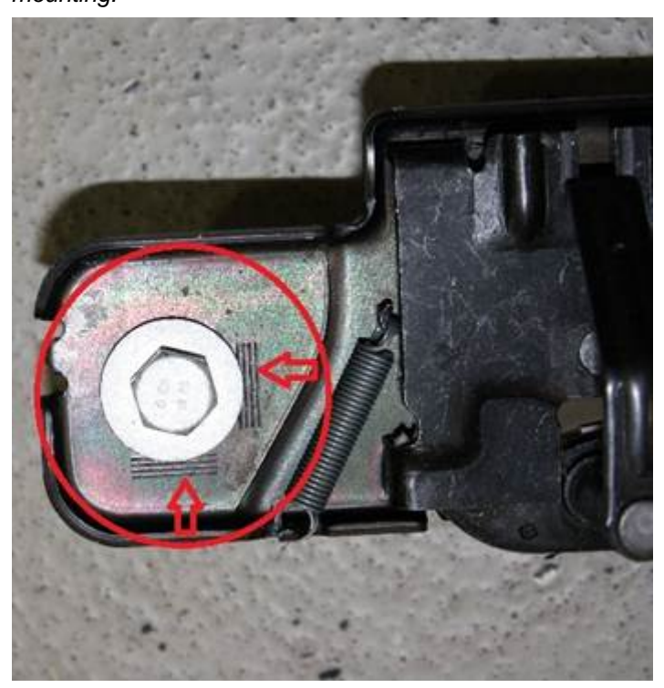
Figure 4. Power lid's motorized striker plate adjustability and serrated indicators.