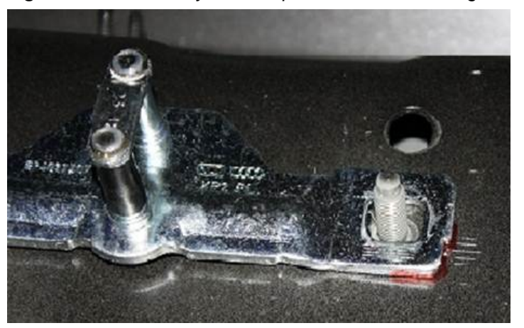
Figure 6. Manual lid style striker plate adjustability and serrated indicators.