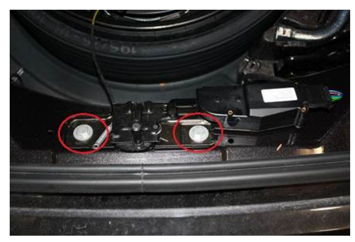
Figure 3. Power lid's motorized striker plate bolted mounting.

Tip: Use a permanent marker to mark original position.