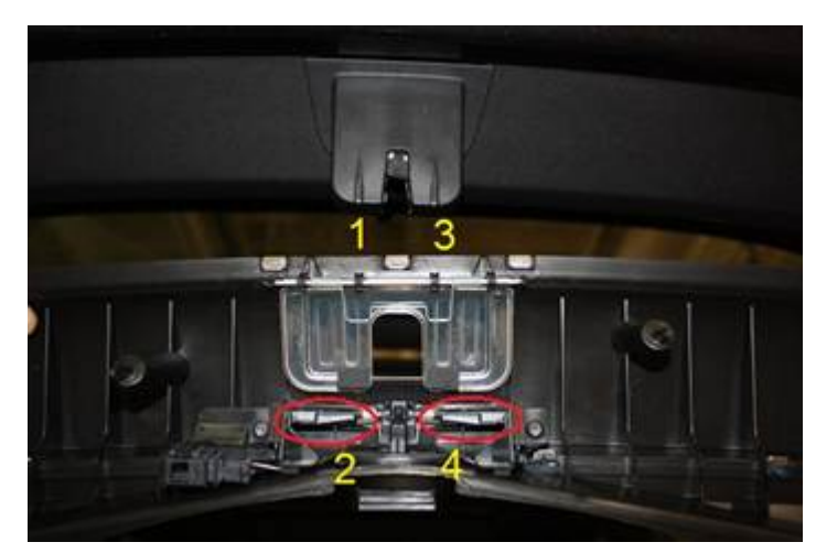
Figure 1. Inside vehicle view of rear lid latch showing location of G526 (2) and G525 (4) on rear sill trim, and contact points (1 and 3).