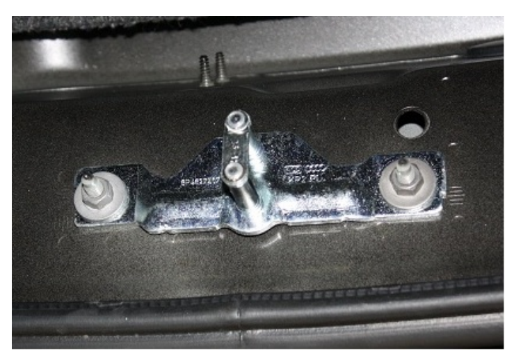
Figure 5. Manual lid style striker plate studded mounting.