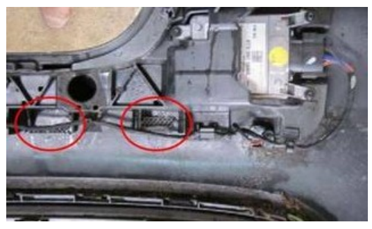
Figure 2. Mounting bracket for one of the ECUs.