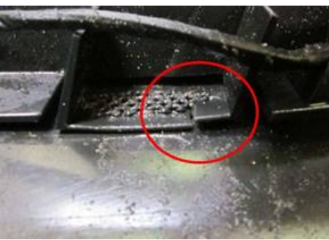
Figure 3. Mounting bracket broken