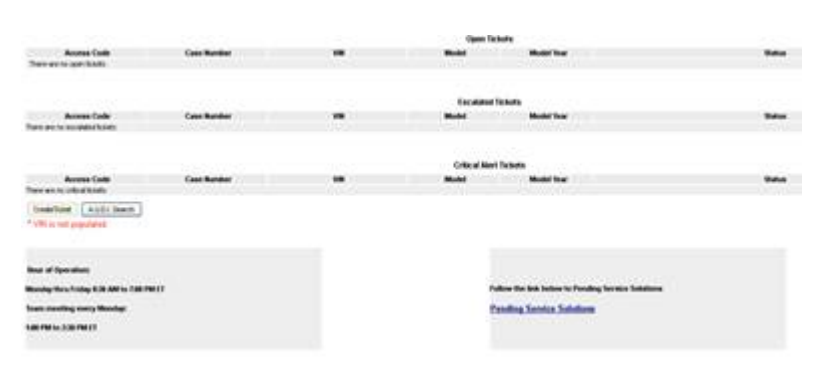
Figure 2. Technical Assistance page