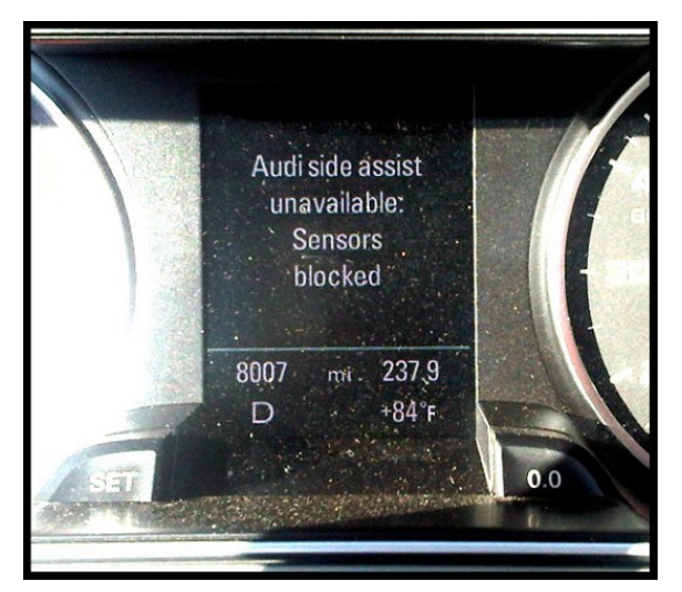
Figure 1. Audi Side Assist warning in DIS

• The system is able to be activated approximately ten minutes after the traffic condition is removed, or after an ignition cycle.