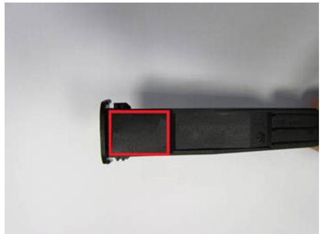
Figure 2. Area to attach insert to door handle touch sensor.