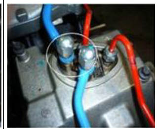
HP Fuel Pump