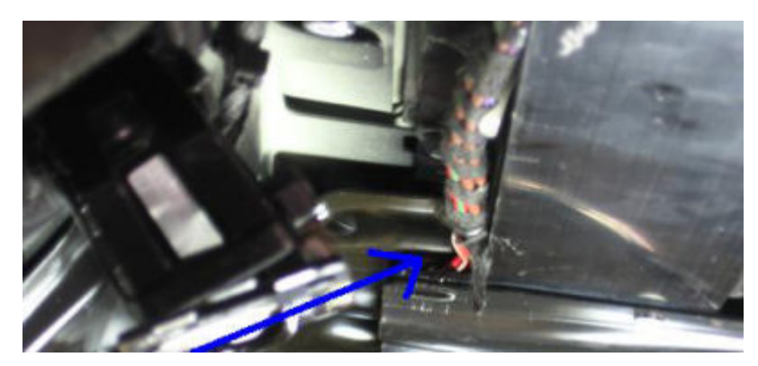
Figure 4. Wire, pinched between the sunroof frame and the bracket that holds the frame to the body on the left side of the vehicle above the C-pillar. Photo taken from the rear hatch opening.