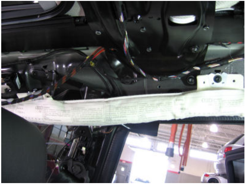
Figure 1. Sunroof frame and mounting bracket above left rear door.

During vehicle assembly, the wire harness that is routed along the left side of the sunroof frame may be pinched at one of the sunroof frame to body assembly points (Figure 1 - Figure 4).