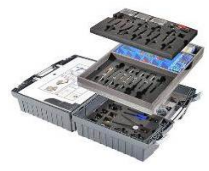
Figure 5. VAS Repair Kit 1978

Repair damaged wires using the VAS Repair Kit 1978 (Figure 5).