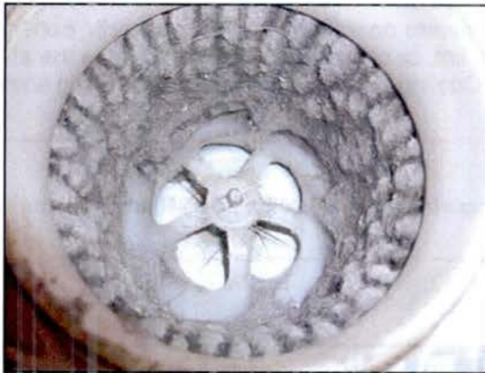
Figure 1. HV Battery Cooling Fan BEFORE Cleaning