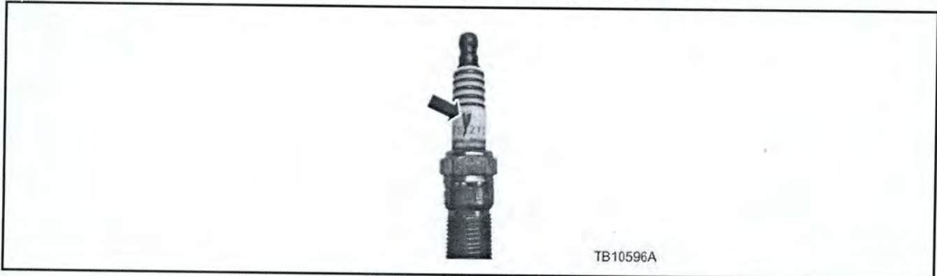
Figure 1 - Article 14-0180

NOTE: The information contained in Technical Service Bulletins is intended for use by trained, professional technicians with the knowledge, tools, and equipment to do the job properly and safely. It informs these technicians of conditions that may occur on some vehicles, or provides information that could assist in proper vehicle service. The procedures should not be performed by "do-it-yourselfers". Do not assume that a condition described affects your car or truck. Contact a Ford, Lincoln, or Mercury dealership to determine whether the bulletin applies to your vehicle. Warranty Policy and Extended Service Plan documentation determine Warranty and/or Extended Service Plan coverage unless stated otherwise in the TSB article. The information in this Technical Service Bulletin (TSB) was current at the time of printing. Ford Motor Company reserves the right to supersede this information with updates. The most recent information is available through Ford Motor Company's on-line technical resources.