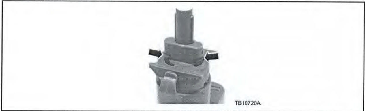
Figure 2 - Article 15-0110