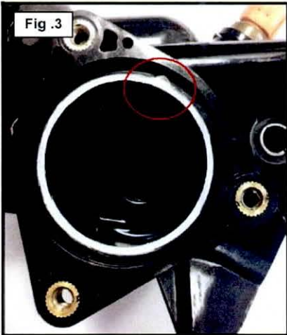
Alignment Tab on Thermostat Housing

To prevent any further repeat repairs, follow the procedure outlined on KGIS and remove all necessary components to gain proper access, including the air box assembly . Correctly position the thermostat in the housing by aligning the tab on the thermostat housing (Fig. 3) with the tab on the thermostat body (Fig. 4). Try rotating the thermostat to validate if it is properly indexed and seated. No movement should be possible, if properly installed. Make sure the thermostat does not move during installation of the housing as this could cause repeat repairs.