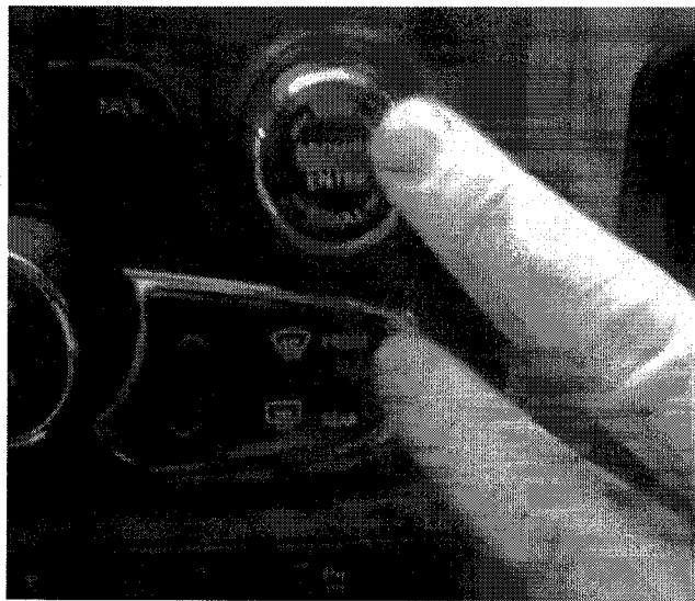
Fig. 2 Take Vehicle Out of Ship Mode