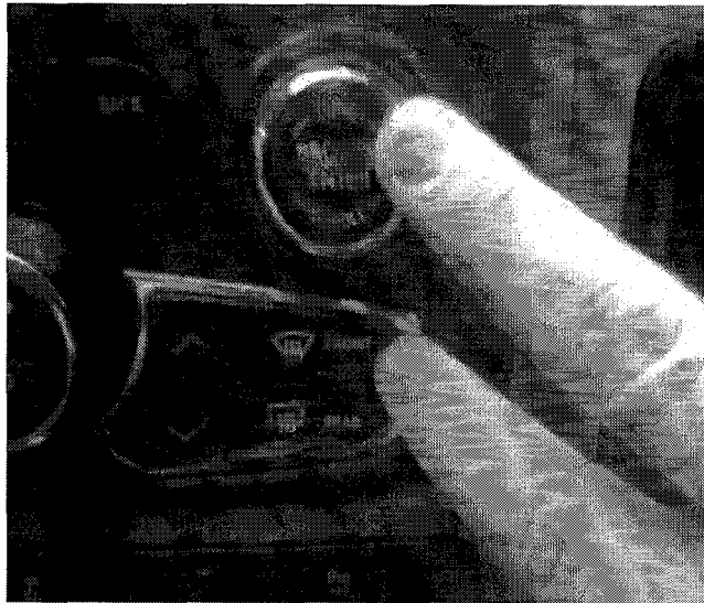
Fig. 2 Take Vehicle Out of Ship Mode