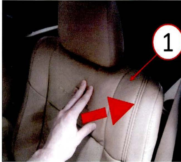
Fig. 1 Inspection