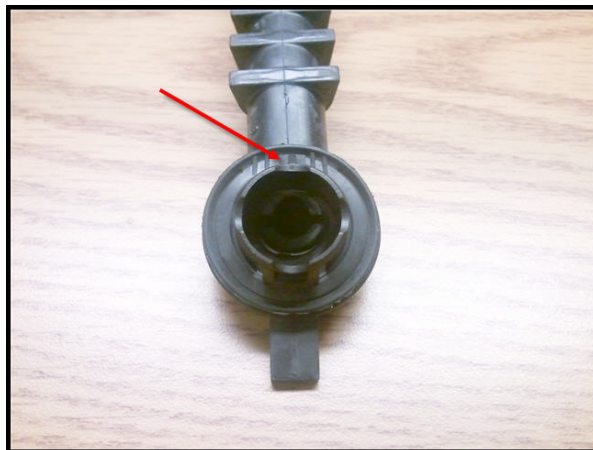
Figure 1. Incorrectly assembled drain hose, with locating tab pointing up.