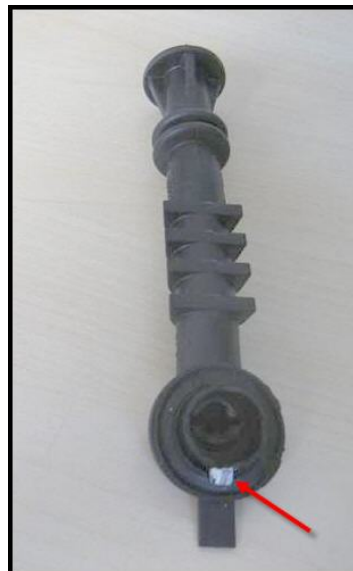
Figure 3. White mark on locating tab.

Service parts have been checked, but it is still possible to receive unchecked parts. Corrected parts will be marked in white on the locating tab. This tab must be pointing down (Figure 3).