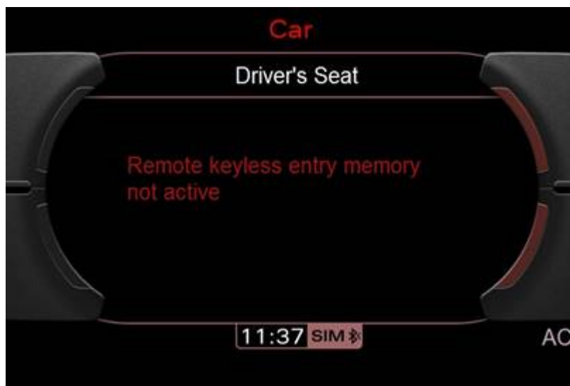
Figure 1. MMI message. The exact message may vary from the message pictured here.