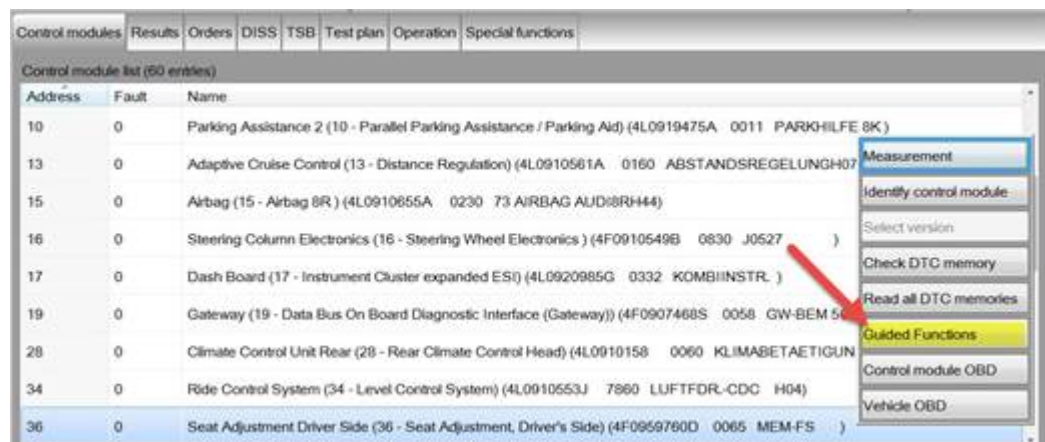
Figure 2. Selecting Guided Functions.