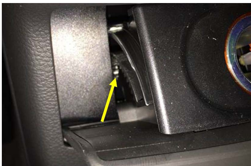
Figure 1. Slow release brake wheel.

Ensure that the slow release brake wheel (Figure 1) is not damaged or missing. The slow release brake wheel prevents the compartment from opening too quickly.